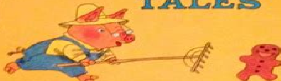
THE GINGERBREAD MAN