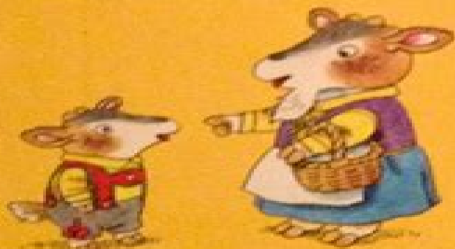
THE WOLF AND THE KIDS