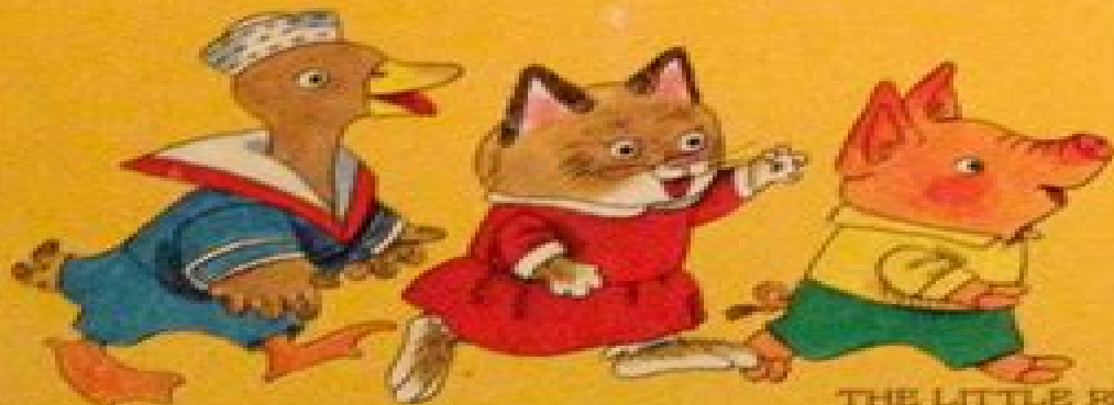
THE LITTLE RED HEN