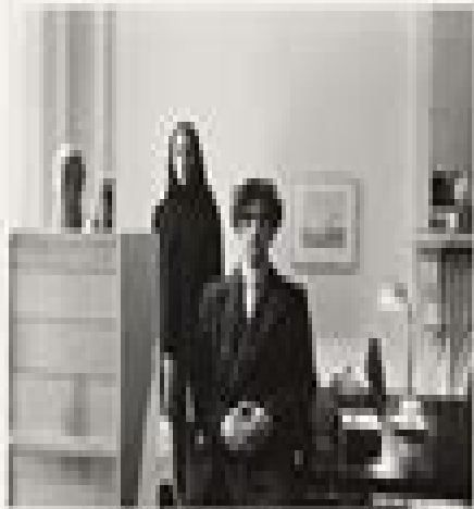
Portrait - August