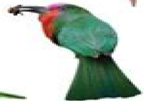
Red-bearded Bee Eater