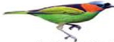
Red-bearded Bee Eater