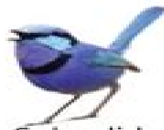
Splendid Fairy Wren