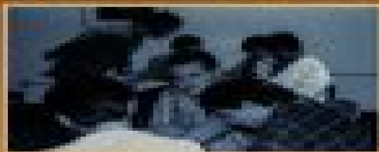
Illustration by Lyndee Trevino