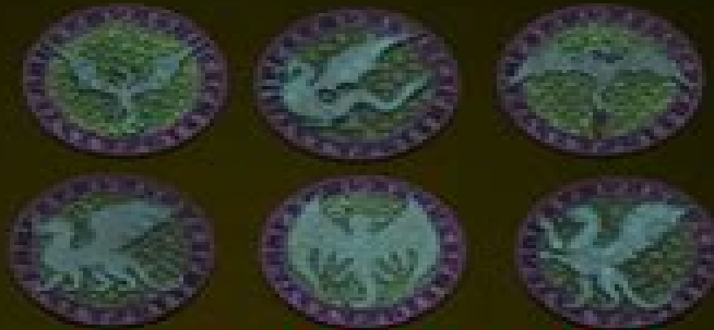
Dragon Shadows - Vol.1