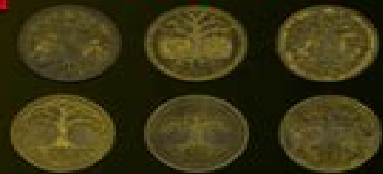
Elves - Vol.1