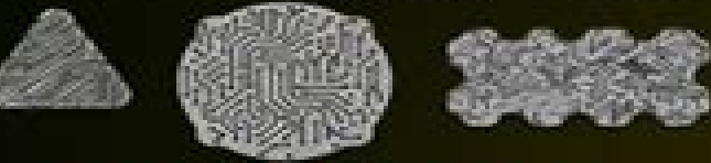
SciFi - Vol.1