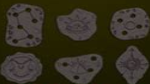
Aliens Vol. 1