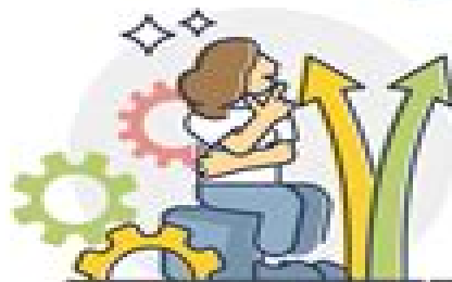
DECISION MAKING AND MOTOR CONTROL