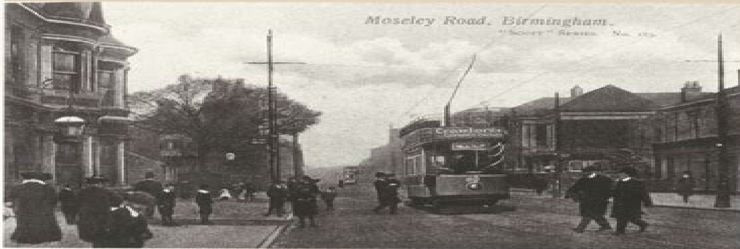
Moseley Road, Birmingham.