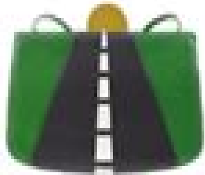
Sac a Malice