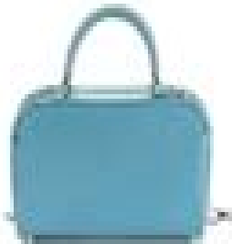
Sac en Vie