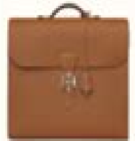
Sac a Depeches