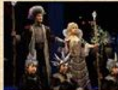
A MIDSUMMER NIGHT'S DREAM