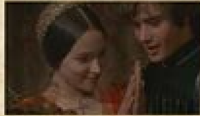
ROMEO AND JULIET