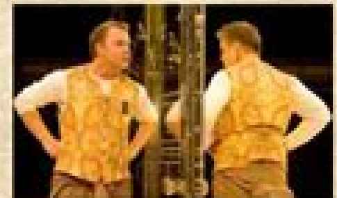
THE COMEDY OF ERRORS