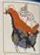
Immature Immature Immature Immature

The Bald Eagle is a symbol of ferocious but intelligent intelligence and courage. During the winter, it is often accompanied with large flocks of waterfowl, which provide an abundant source of food. The species' long white head and neck (both of equal length) are in sharp contrast with the dark body. The eagle's bill is hooked and sharp, with a serrated edge. The eagle's feet are powerful and sharp, with a serrated edge. The eagle's talons are powerful and sharp, with a serrated edge.