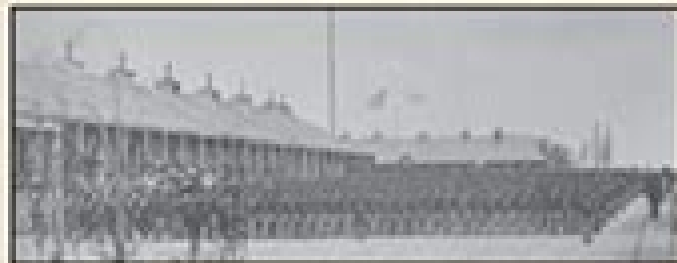
1864 - Dutchess County Poorhouse, Long Hill Street, Poughkeepsie