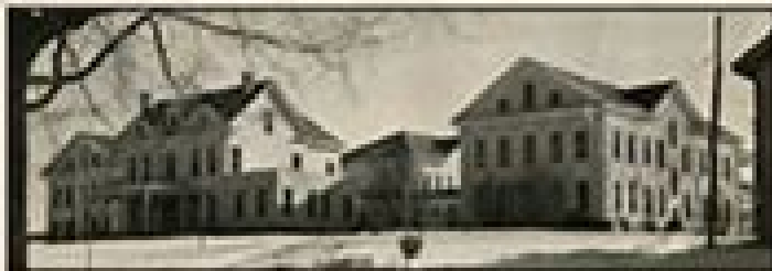
1917 - Dutchess County Almshouse, Long Hill Street, Poughkeepsie