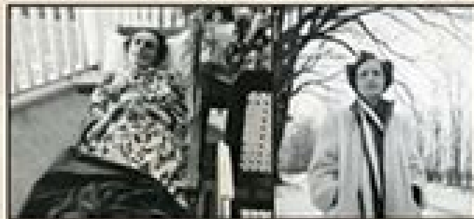
1931 - Dutchess County Almshouse, Long Hill Street, Poughkeepsie 1931 - Dutchess County Almshouse, Long Hill Street, Poughkeepsie 1931 - Dutchess County Almshouse, Long Hill Street, Poughkeepsie 1931 - Dutchess County Almshouse, Long Hill Street, Poughkeepsie