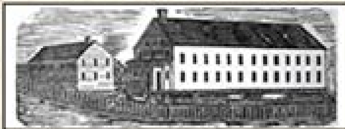
1864 - Dutchess County Poorhouse, Long Hill Street, Poughkeepsie