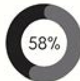
College Students by Gender

More female undergraduate students in the US than male ones – 58% vs. 42%