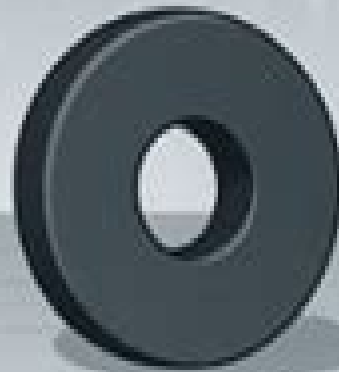
SILICON CARBIDE SiC