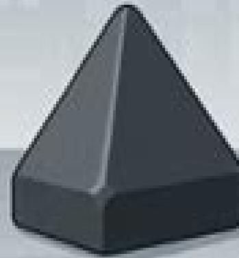
BORON CARBIDE B 4 C