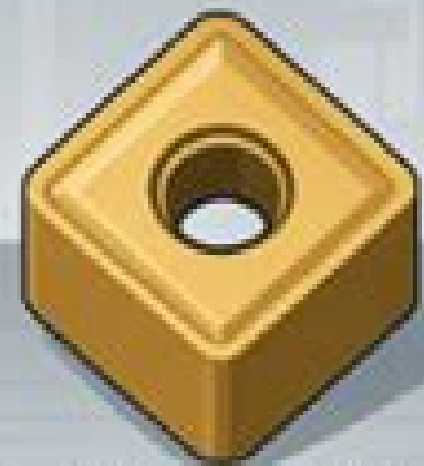
TITANIUM CARBIDE TiC