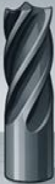
TUNGSTEN CARBIDE W-C