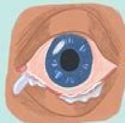
Red or watery eyes