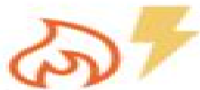
Fire and lightning