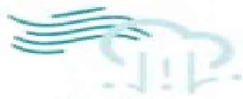
Windstorm and hail