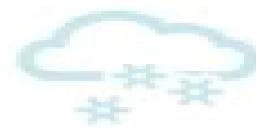
Weight of ice, sleet, and snow