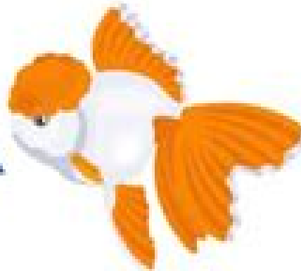
ORANDA RED CAP