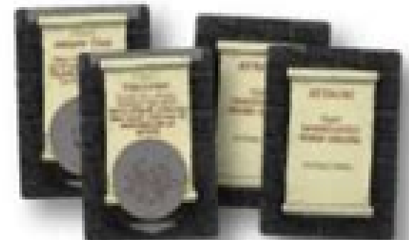
32 x Trap & Attack! Cards