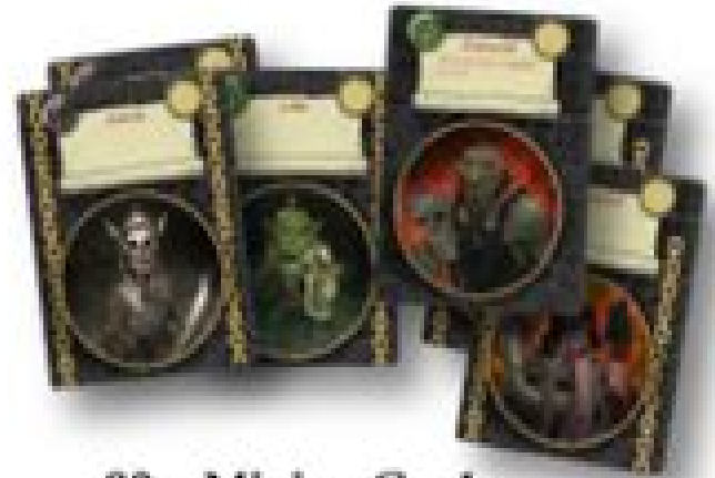
80 x Minion Cards