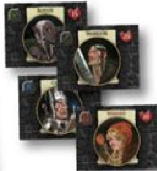
4 x "Hero" Cards