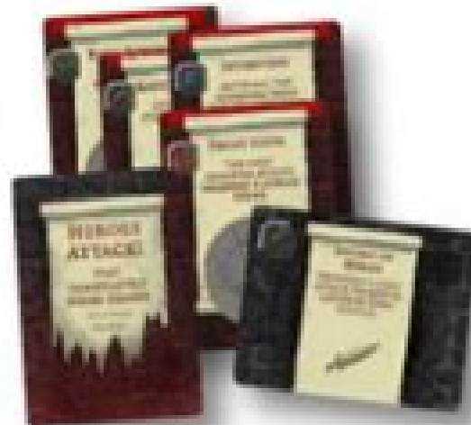
40 x Hero Ability Cards

Includes: How To Stop Heroes from Stealing All Our Gold Rulebook