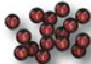
30 x Health Tokens

Includes: How To Stop Heroes from Stealing All Our Gold Rulebook