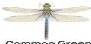
Common Green Darner