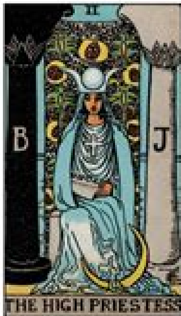
THE HIGH PRIESTESS.