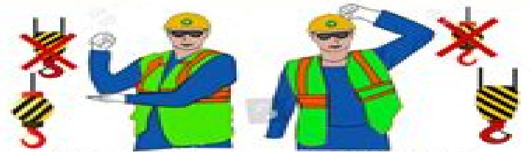
USE WHIP LINE