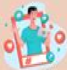
Become an Influencer