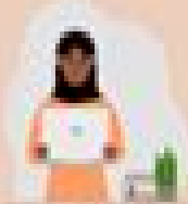
Sell an online course