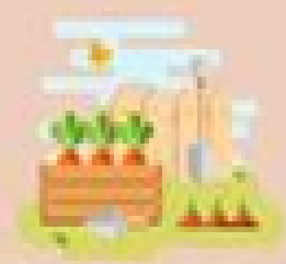
Sell Home-Grown Produce