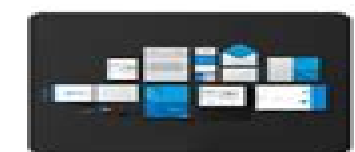
Brand Identity Design