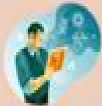
Become a Subject matter expert