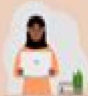
Sell an online course