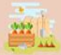
Sell Home-Grown Produce