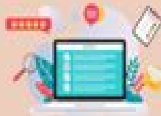
Fill Online Surveys