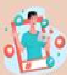
Become an Influencer