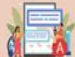
Online Translation Job