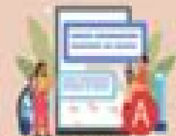
Online Translation Job