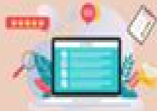
Fill Online Surveys