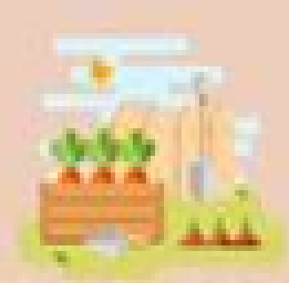
Sell Home-Grown Produce