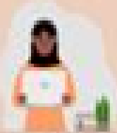
Sell an online course