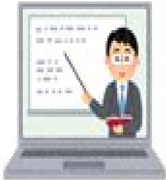
Online courses / Online Learning