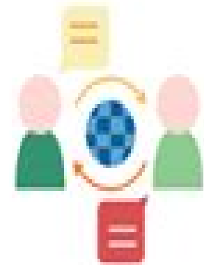
Synchronous vs. Asynchronous learning