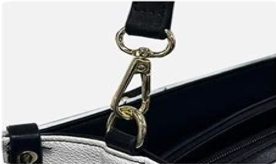
■ Removable Long Strap