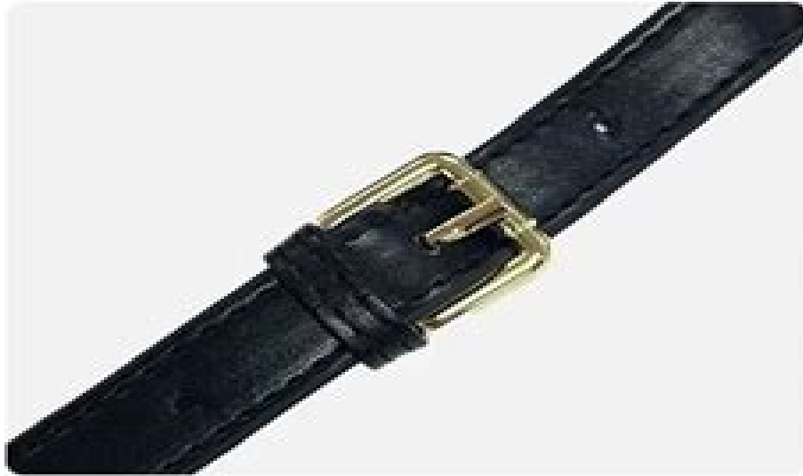
■ Adjustable Strap