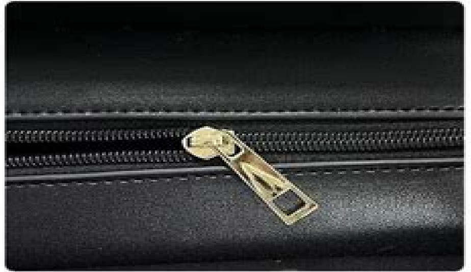
■ Exquisite Zipper