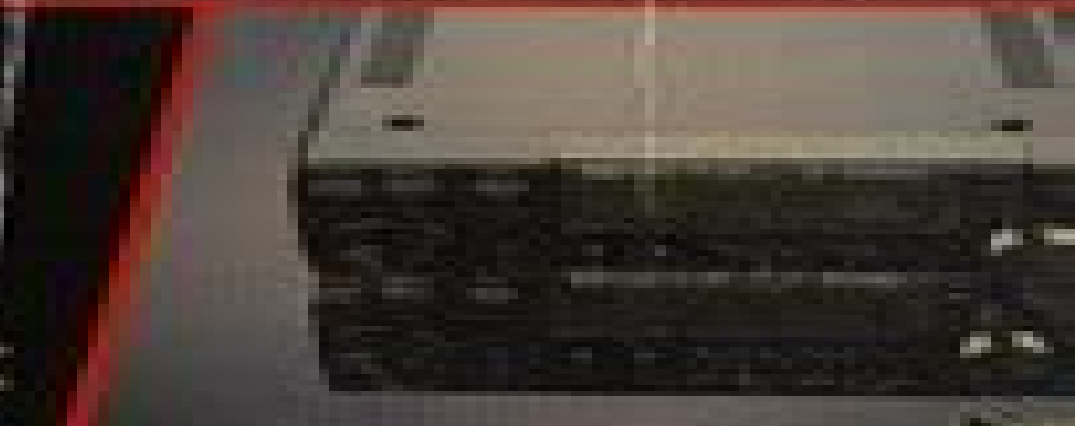
A General Electric Model 1000