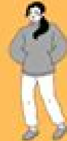
HANDS IN POCKETS