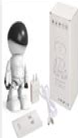
353° Robot Security WiFi Camera