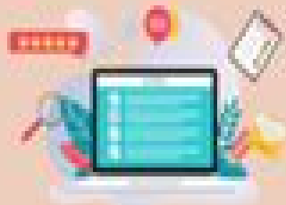
Fill Online Surveys