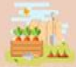
Sell Home-Grown Produce