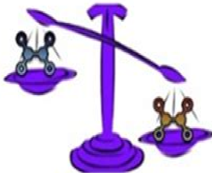
Non-Local Measure 2