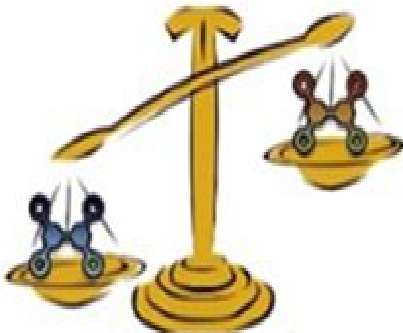
Non-Local Measure 1