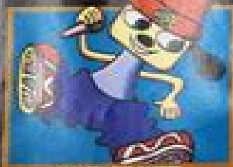
PARAPPA THE RAPPER