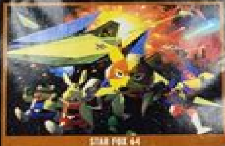
STAR FOX 64