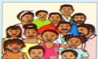
a _____ of people