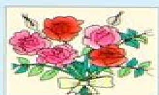
a _____ of flowers