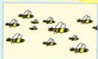
a _____ of bees