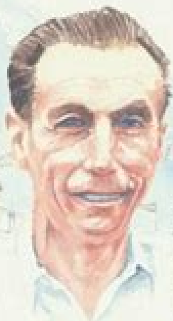
Sir Stanley Matthews