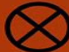
LOT OF FORTUNE