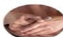
Topical Pain Relievers