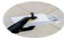
Reachers and Grabbers

Several devices can help reduce the strain on your joints and enhance your ability to perform daily tasks: