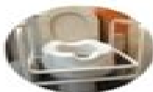
Raised Toilet Seats