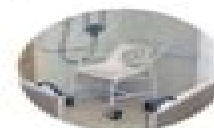
Shower Chairs and Handheld Showers