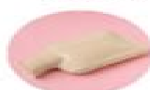
Heat and Cold Therapies

Managing arthritis pain is crucial for maintaining your quality of life: