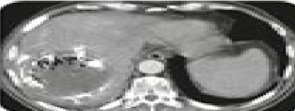
Hepatic FDG Uptake in PET/CT