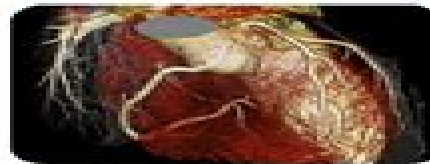
Cardiac Dual Source CT

New: Clinical Benefit of PET/CT Applications