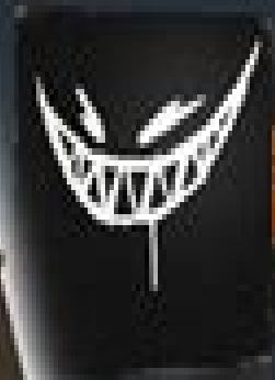
Me, High Noon