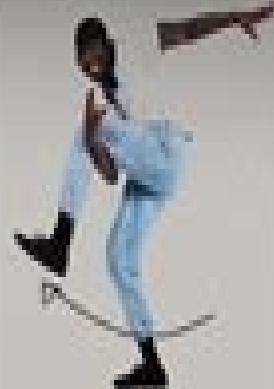
to the feet