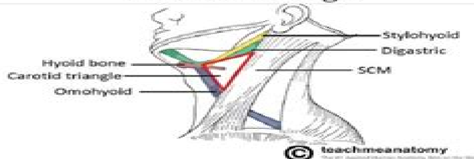
Fig 1.1 – Carotid triangle of the neck