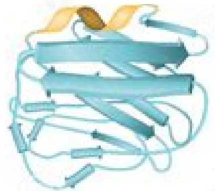
Proteins (monomer of a CRP)