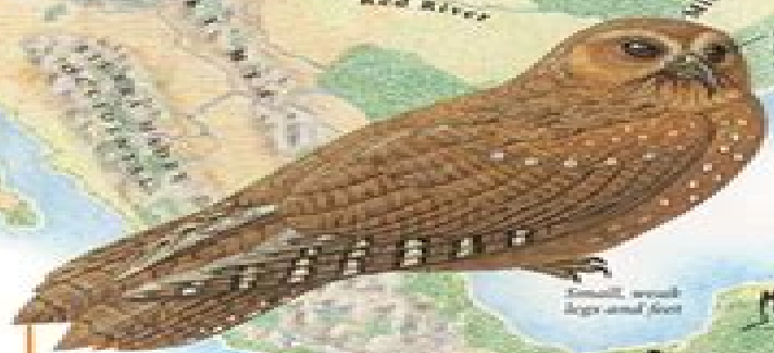
Oilbird ( Steatornis caripensis ) Length: 1 ft 7 in (49 cm)