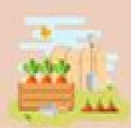
Sell Home-Grown Produce