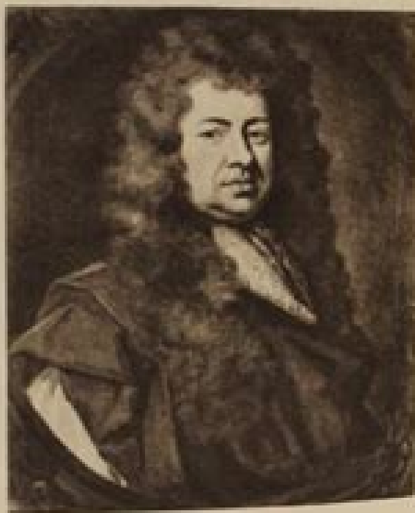
Samuel Pepys from the Picture by Sir Godfrey Kneller in the Pepysian Library, Magdalene College, Cambridge