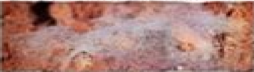
FIRE IN THE NIGHT