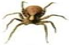
Arctic Wolf Spider