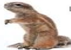
Arctic Ground Squirrel