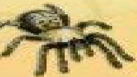
hairy bird-eating spider