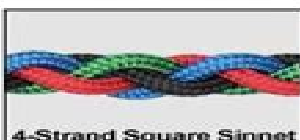
4-Strand Square Sinnet