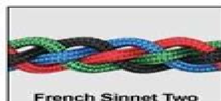
French Sinnet Two