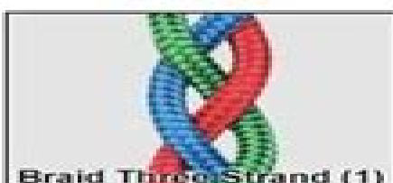
Braid Three Strand (1)