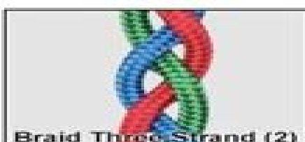
Braid Three Strand (2)