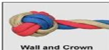
Wall and Crown