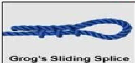
Grog's Sliding Splice