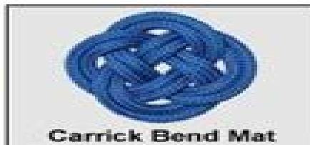
Carrick Bend Mat