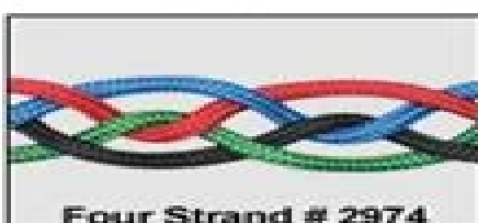
Four Strand # 2974