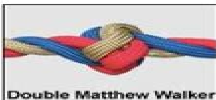
Double Matthew Walker