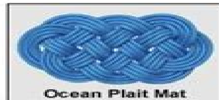
Ocean Plait Mat