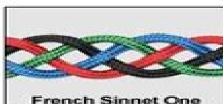
French Sinnet One