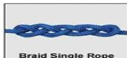
Braid Single Rope