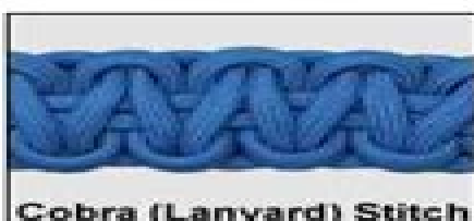
Cobra (Lanyard) Stitch