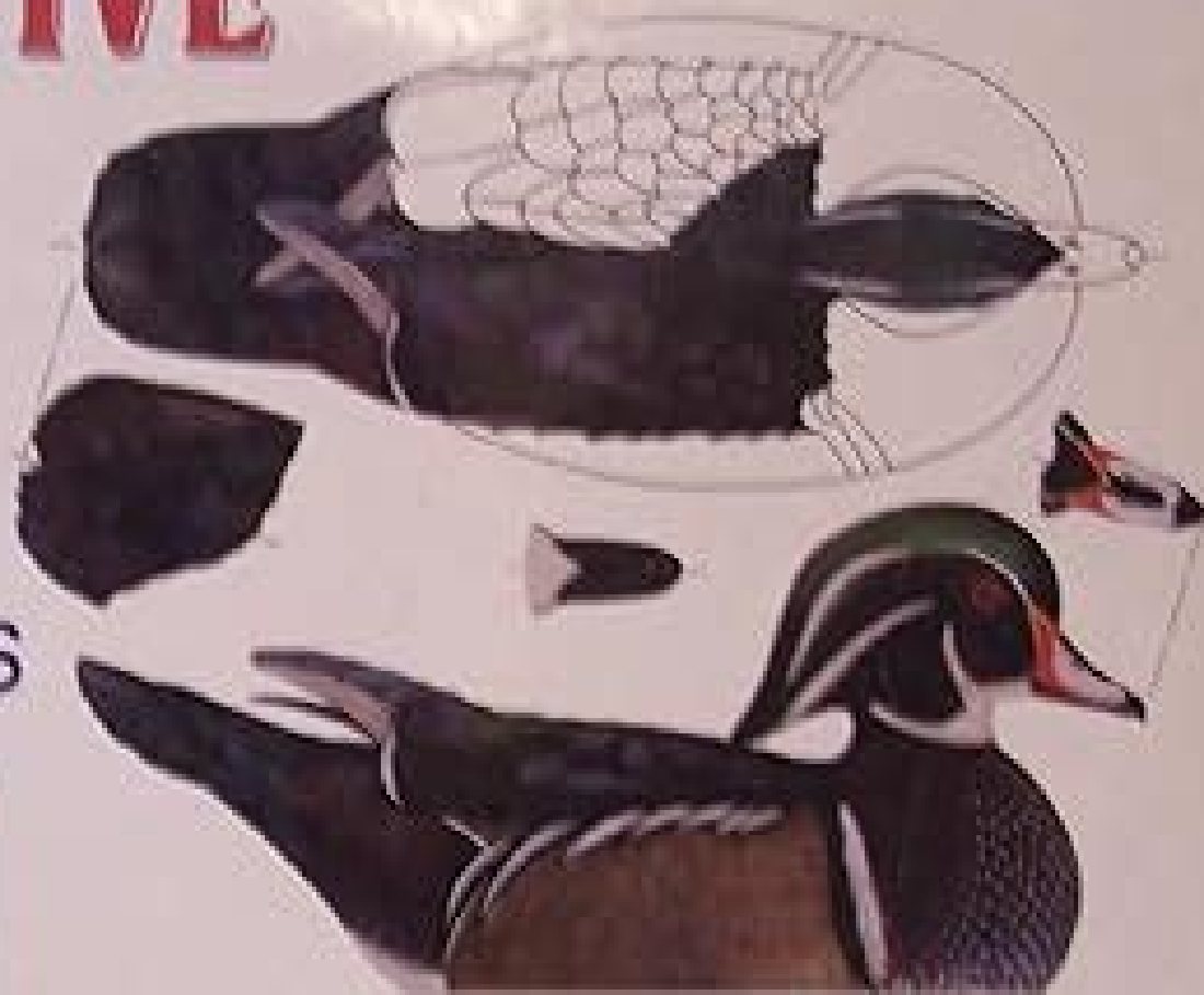
SPRING WOOD DUCK HEAD

Step-by-step instructions, patterns and detailed painting guide by a renowned master of the art.