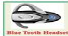
Blue Tooth Headset

Computer network is also used for sharing hardware like scanners and printers, with everyone on the network group. This reduces the cost of buying computer hardware as laser printers and large hard disks can be expensive. Networks enable users to share such equipments by networking microcomputers or workstations.